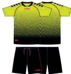
5279 SAFETY YELLOW/ BLACK