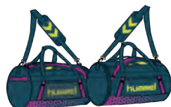
8557 LEGION BLUE/PINK GLO