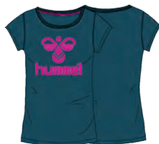
8557 LEGION BLUE/ PINK GLO