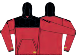
3015 FLAME SCARLET