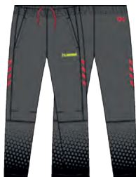
1024 LIGHT MAGNET

210 gm 2 100% polyester knit Zippered hand pockets Knee darts for better mobility Valknut gradient print at bottom legs Screenprinted hummel, chevrons, and Rebel signoff logo