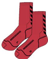
3015 FLAME SCARLET