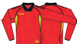
3015 FLAME SCARLET