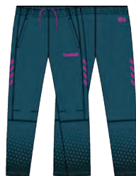
7511 LEGION BLUE