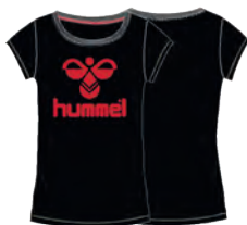
1034 BLACK/FLAME SCARLET

100% cotton single jersey Col. 2006 is yarn dyed Waterbased print Regular fit