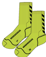
5998 SAFETY YELLOW