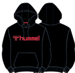
1034 BLACK/FLAME SCARLET

80% cotton/20% polyester Sweat fleece Waterbased print Regular fit