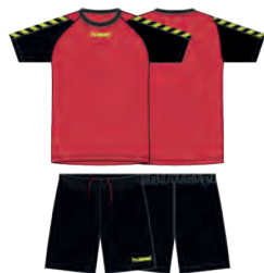
4048 FLAME SCARLET/ BLACK