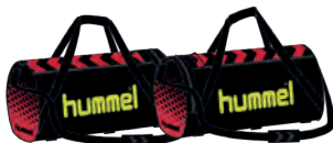
1034 BLACK/FLAME SCARLET

100% Polyester, woven fabric (Oxford) Lining: 100% Polyester Piping detail Printed logos and chevrons Printed Valknut gradient pattern Bottom stabilizer and inside pocket Diagonal handles Adjustable, detachable shoulder strap End pocket Size: L65*D35cm Max weight: 15kg