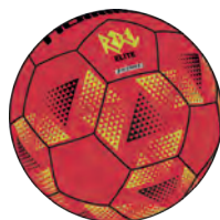
3015 FLAME SCARLET

3 years guarantee on stitchings and shape