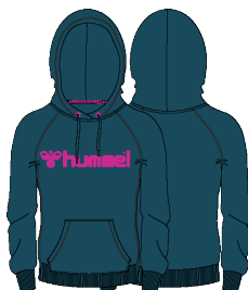
8557 LEGION BLUE/ PINK GLO