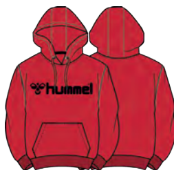
3015 FLAME SCARLET