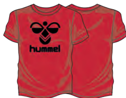
3015 FLAME SCARLET