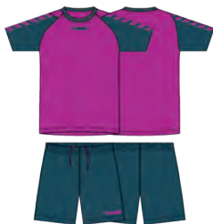
4047 PINK GLO/LEGION BLUE

Woven chevron tape and embroidered logos