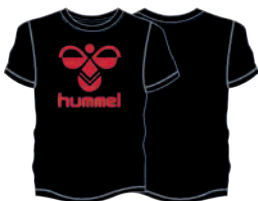
1034 BLACK/FLAME SCARLET

95% cotton/5% elastane Single jersey Waterbased print Deco stitchings Regular fit