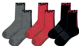
7995 MULTI COLOUR