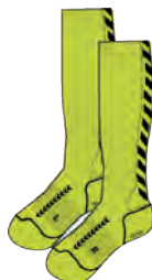
5998 SAFETY YELLOW