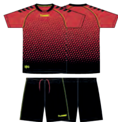
4048 FLAME SCARLET/ BLACK