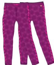
3286 FUCHSIA PURPLE