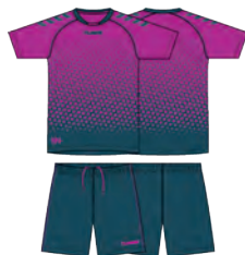
4047 PINK GLO/LEGION BLUE