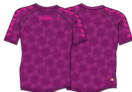
3286 FUCHSIA PURPLE