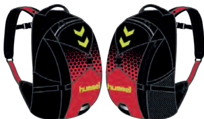
1034 BLACK/FLAME SCARLET

100% Polyester, woven fabric (dull oxford) Printed chevron and logos Printed Valknut gradient pattern Laptop compatible Mesh football storage Shaped padded shoulder straps Adjustable chest strap Bike light attachment Reflective details Inside key clip Zipper pocket on the hip Size: 35Liter, H48*W34*L22cm Max weight: 10kg