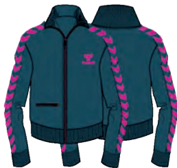
8557 LEGION BLUE/ PINK GLO

100% polyester Tricot with dull finish Embroidered logo Chevron tape Zipper pocket Regular fit