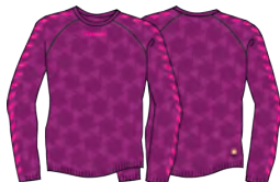
3286 FUCHSIA PURPLE