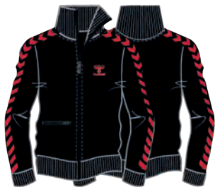
1034 BLACK/FLAME SCARLET

100% polyester Tricot with dull finish Embroidered logo Chevron tape Zipper pocket Regular fit