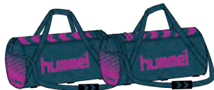
8557 LEGION BLUE/PINK GLO