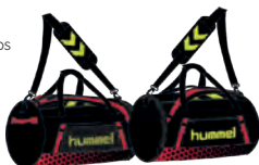
1034 BLACK/FLAME SCARLET

100% Polyester, woven fabric (dull oxford) Printed chevrons and logo Printed Valknut gradient pattern Reflective logo on one side Converts to back pack with shaped padded shoulder straps End pocket for wet storage Side zip pocket Mesh side pocket Inside pocket Compression straps Size: 43Liter, L55*D28cm Max weight: 15kg