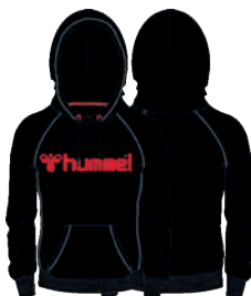
1034 BLACK/FLAME SCARLET

80% cotton/20% polyester sweat fleece Waterbased print Special pocket placement Contrast details Regular fit