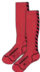
3015 FLAME SCARLET